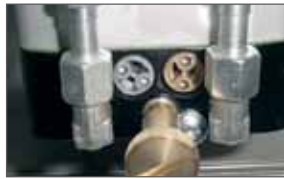
By pass valves for the force adjustment