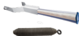
Oval beam 19.5 feet (6m) Oval beam 23 feet (7m) Oval beam 24.6 feet (7,5m) in two pieces + fork + spring + blunt free rubber + profile for LED