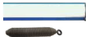
Oval beam 23 feet Oval beam 24,6 feet + balancing spring with blunt free rubber + profile LED (Sticker not included)