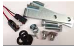
Mechanical and electronic limit switches