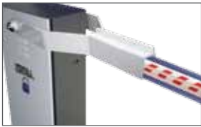
Double fork coupling for oval beam