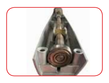
Screw with ball bearing